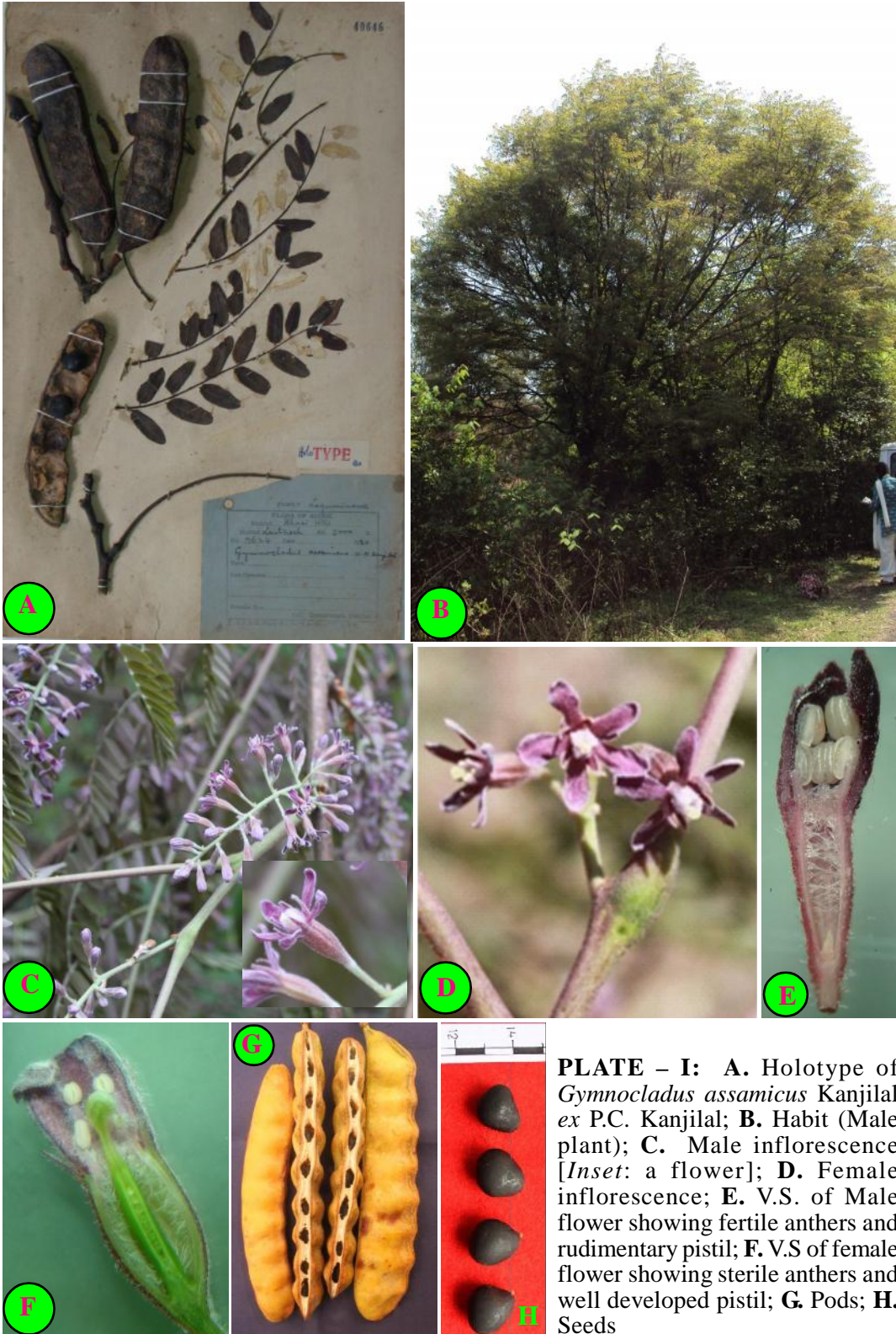
PLATE – I: A. Holotype of Gymnocladus assamica Kanjilal ex P.C. Kanjilal; B. Habit (Male plant); C. Male inflorescence [ Inset: a flower]; D. Female inflorescence; E. V.S. of Male flower showing fertile anthers and rudimentary pistil; F. V.S. of female flower showing sterile anthers and well developed pistil; G. Pods; H. Seeds